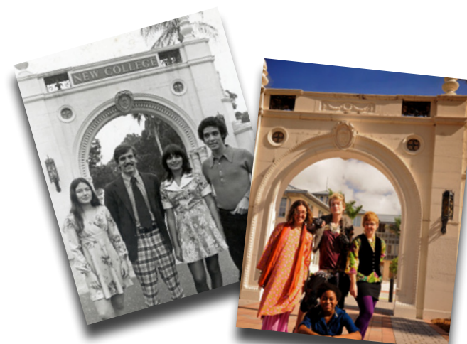
Cover Image: Then and now: The changing face of the New College student. Story on Page 10

It's that time of year... Get all your reunion information, including the schedule of events, registration forms and more.